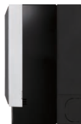
DESIGNER SERIES Depth 195mm